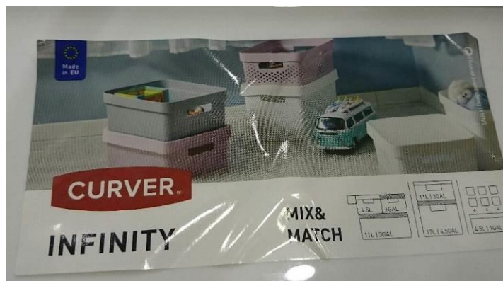
Wrong labeling folder