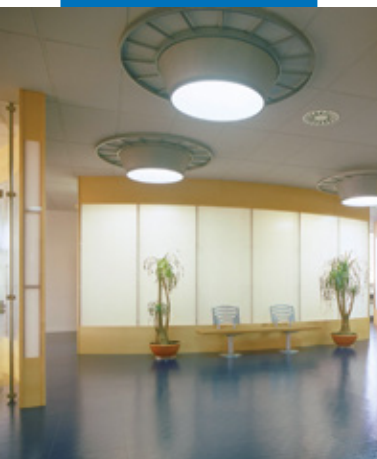
Example of rubber flooring tiles laid using Ultrabond Eco Fix - IBM Centre - Spain