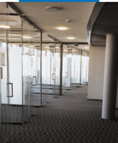
Carpet laid in Post Office Centre using Ultrabond Eco Fix - Post Tower - Italy