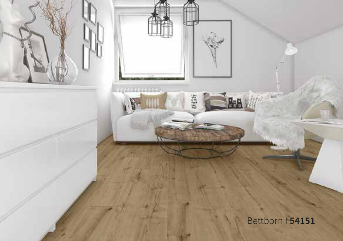
Bettborn | 54151