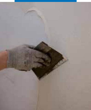
Application of Ultrabond Eco V4 SP Fiber on a wall