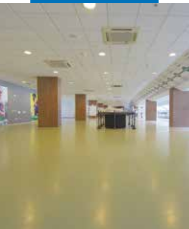
Stadium Fortaleza - Brasile