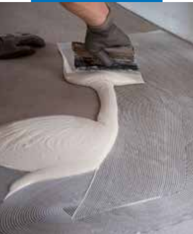
Application of Ultrabond Eco V4 SP Fiber on a substrate