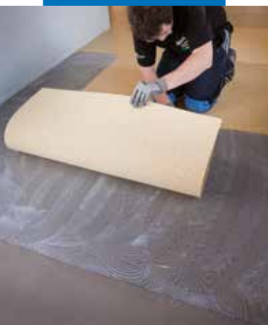
Installation of rubber tiles