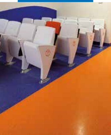
Fondazione Nemo Niguarda Hospital - Milan - Italy