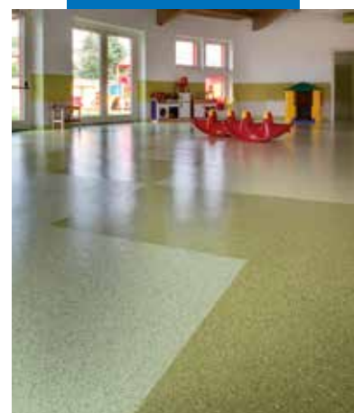
An example of installing rubber flooring in a school: Municipal Infants School, Carobbio degli Angeli (Bergamo)