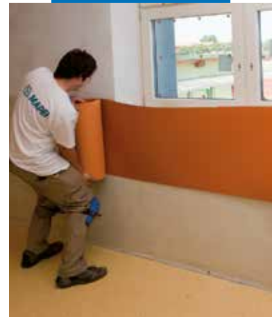
Application of rubber sheeting on a wall

All relevant references for the product are available upon request and from www.mapei.com