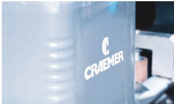
Example: Logo (hot stamping)