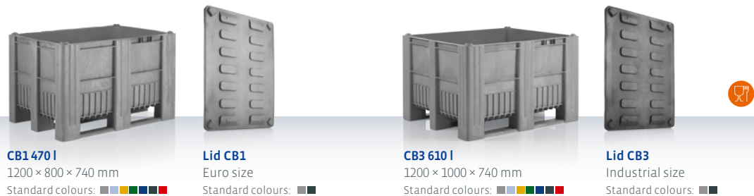
CB1 470 l 1200 × 800 × 740 mm Standard colours: ■ ■ ■ ■ ■ ■ ■ ■