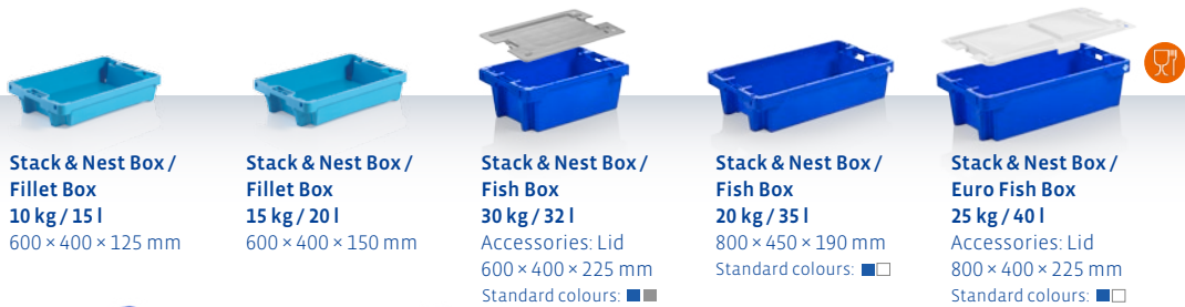
Stack & Nest Box / Fillet Box 10 kg / 15 l 600 × 400 × 125 mm