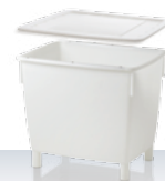
Large Container 400 l Accessories: Lid, trolley 945 × 725 × 830 mm