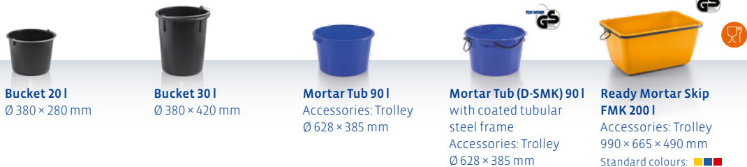
Bucket 20 l Ø 380 × 280 mm