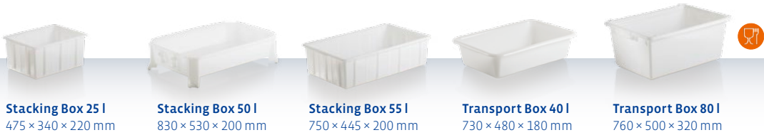
Stacking Box 25 l 475 × 340 × 220 mm