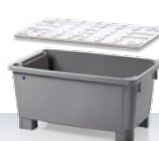
Stack & Nest Container 300 l Accessories: Lid 1200 × 780 × 580 mm