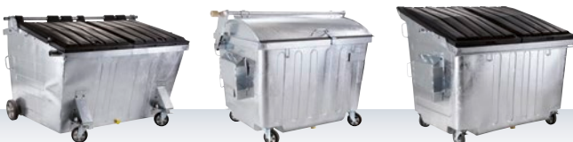
Rear-end loading container 2500 l, 3000 l, 5000 l, 7000 l