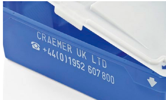
Example: Lettering (hot stamping)

Do you have questions or require detailed information?