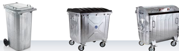
MGB sheet steel 240 l