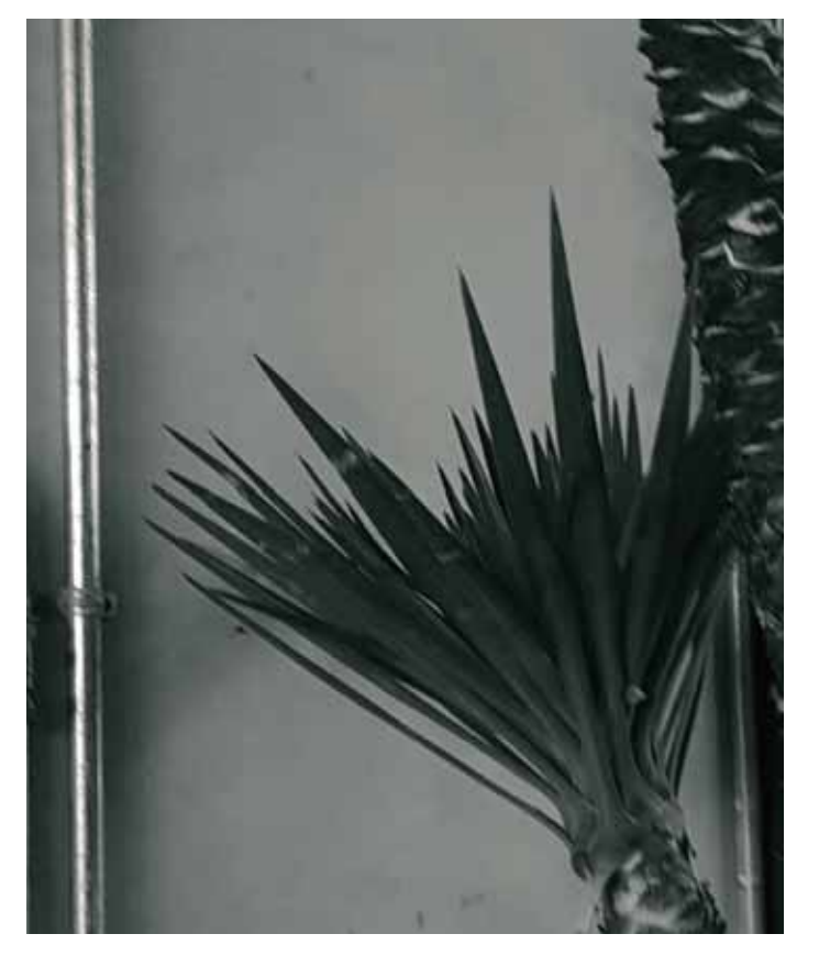
We use only carefully selected, high quality plant-derived product.