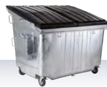
Front-end loading container 2500 l, 5000 l, 7500/8000 l (Images not to scale)