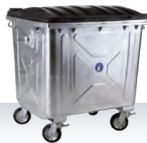
MGB sheet steel 1100 l