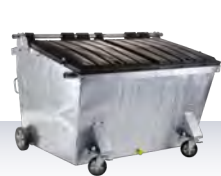
Rear-end loading container 2500 l, 3000 l, 5000 l, 7000 l (Images not to scale)