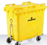
770 l Clinical waste container UN 3291