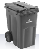
340 l / 360 l Saloon Lid Accessories: Divider wall