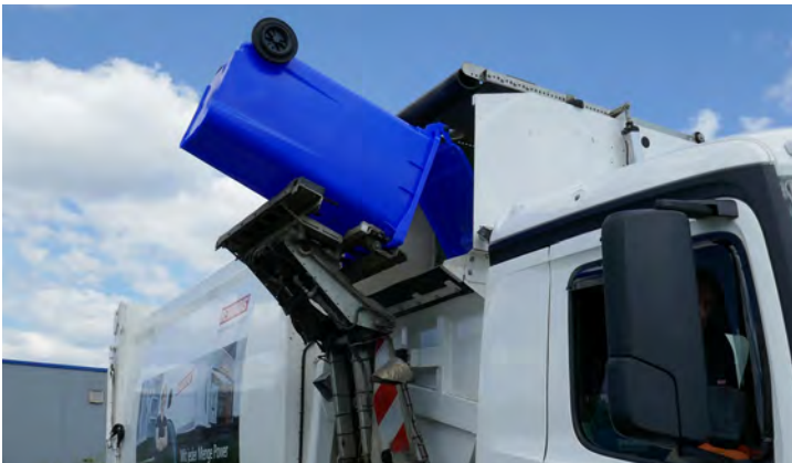
Lifting and emptying test