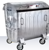
MGB sheet steel 1100 l