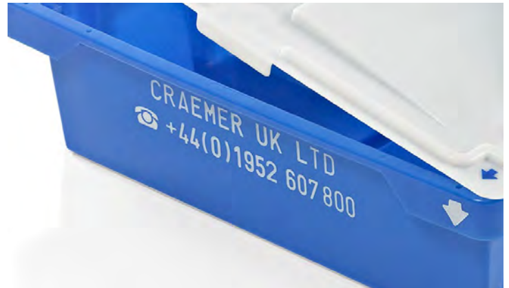
Example: Lettering (hot stamping)