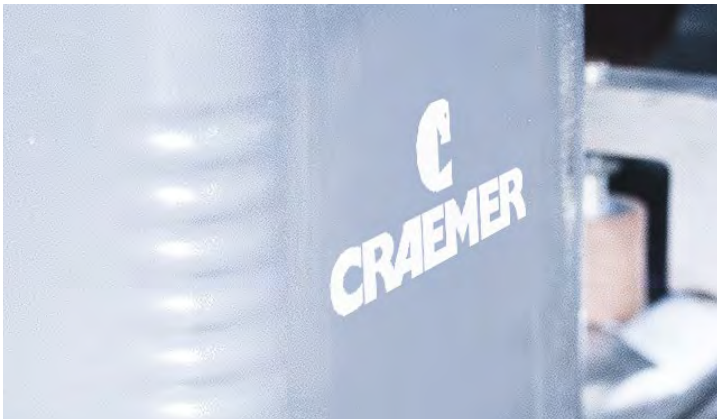
Example: Logo (hot stamping)