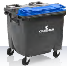
1100 l Lid-in-Lid