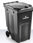
340 l / 360 l