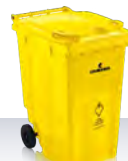
340 l / 360 l Clinical waste container UN 3291